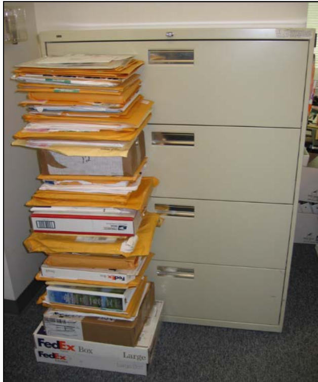
EPA Region 9 Annual Pretreatment Reports