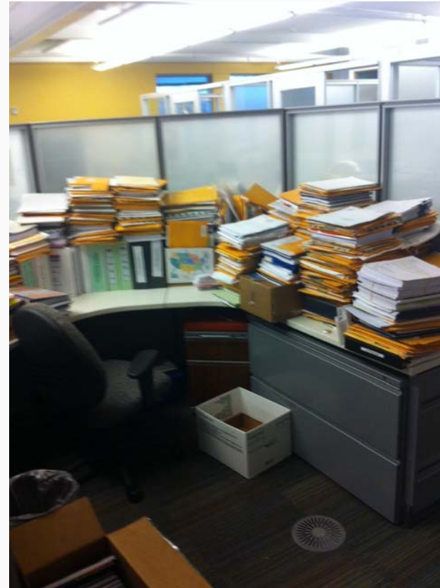
EPA Region 7 Annual Biosolids Reports